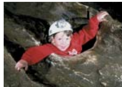
Mammoth Cave Expedition at California Cavern

For information on any of the caverns call: SNRC at 209-736-2708 or email at caverns@cavemtours.com. Much information is available from their web site at www.cavemtours.com, including detailed maps and directions, discount coupons and free school lesson plans.