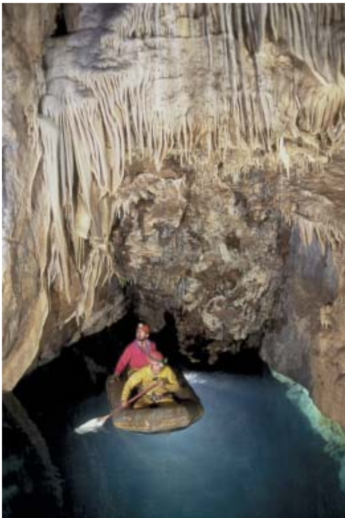
Middle Earth Expedition at California Cavern

ancient archaeological history, being the site of what are probably the oldest human remains in America. Uranium-thorium dating has determined one skull found here to be 12,000 to 13,500 years old. Some ancient remains are on display in the gift shop.