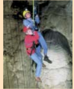
Rappel team at Moaning Cavern

MOANING CAVERN is California's largest single-chambered public cavern. It is open every day, year-round for walking tours, spelunking trips and the 165-foot rope rappel. You can also mine for gemstones, take a walk along the nature trail, and eat your lunch at their picnic tables.