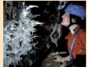
Black Chasm Cavern rare helectite formations in the Landmark Room

BLACK CHASM CAVERN National Natural Landmark will be opening soon. Delays make it hard to predict an opening date, but updates can be found on their web site at www.cavernstours.com . However, one thing is for sure - this cavern is definitely worth waiting for!