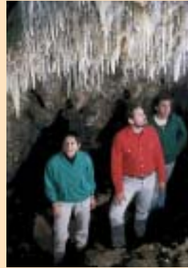
The Jungle Room, California Cavern

call: 209-736-2708 or visit www.cavernstours.com