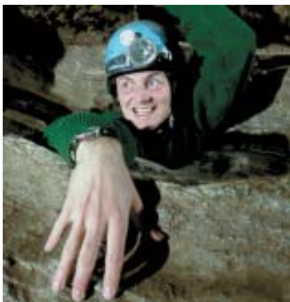
A cool trip spelunking is available to those seeking subterranean natural wonders